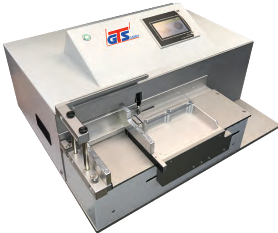
Desktop counting machine